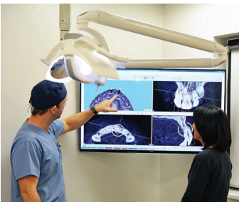
3D printing allows Surgical Implant 3D to bring digital designs to life with precision and accuracy.