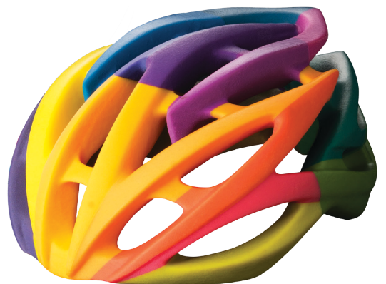
Trek's 3D printed color helmet prototype.

PolyJet technology offers the unique ability to print parts and assemblies made of multiple materials. Parts with different mechanical and physical properties, smooth, durable surfaces and exceptionally fine details are possible, all in a single build. The system can print living hinges, soft-touch parts and overmolds not possible with other technologies. The superior productivity, high quality output and unique multi-material printing capabilities of the Connex printer enable users to closely emulate the look, feel and function of