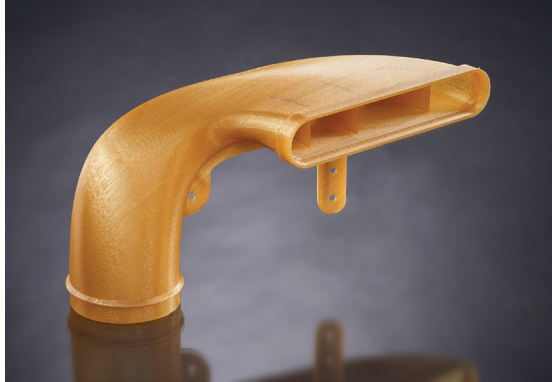
A 3D printed air intake using ULTEM 1010 resin.

In addition, while skilled expertise is required to operate traditional manufacturing machines, a 3D printer gets most of its guidance from a design file. This eliminates many of the skills and training requirements associated with traditional manufacturing, opening up new business models and offering more opportunities for people without access to manufacturing expertise. The flexibility of sending digital files and the relative portability of AM machines also suggests opportunities for new supply chain configurations, as well as new distribution networks.