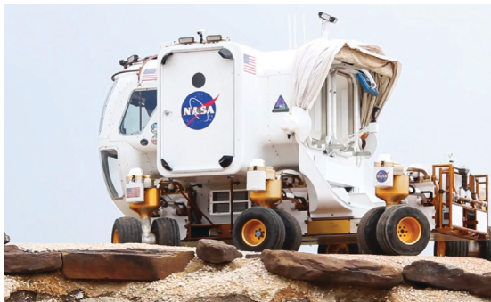
NASA installed 3D printed parts on their Mars rover concept vehicle.

To really come of age, 3D printing needs to make the transition from a rapid prototyping tool to