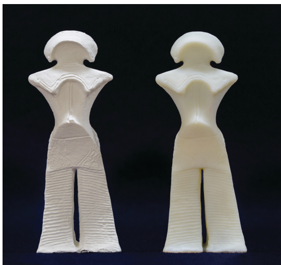
The 3D printed Jomon Goddess sculpture replica (right).

The Yamagata Prefectural Museum in Japan is using 3D printing to create replicas of a 4,500-year-old national treasure, the Jomon Goddess, for museum goers to better learn, explore and touch history. The museum attracted attention with the exhibition of a clay doll replica of the Jomon Goddess. Unearthed in Funagata-cho,