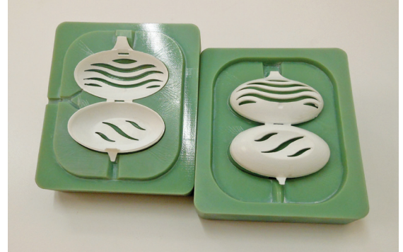
Unilever 3D printed injection mold for Domestos rim block.

The ability to manufacture objects of different shapes and sizes on the same system shifts manufacturing from a paradigm of "economy of scale" to that of an "economy of scope." Combining these two freedoms—freedom of complexity and freedom of variety—suggests that new business models are enabled around optimized and customized manufacturing solutions.