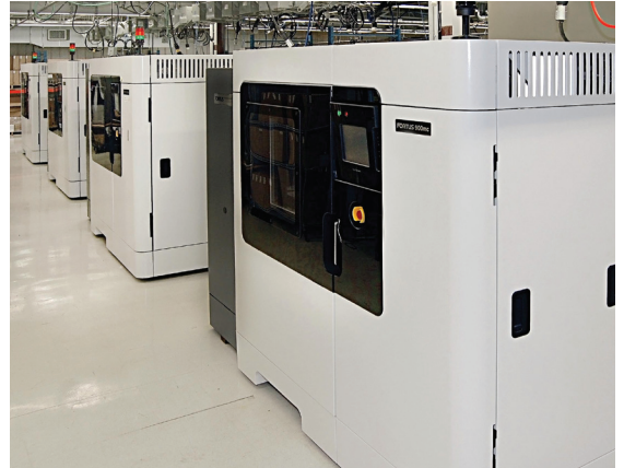
Fortus 3D Printers on a factory floor.

When it comes to measurement applications, PolyJet Tango™, a rubber-like material, is used to avoid scratches when measuring door gaps during assembly.