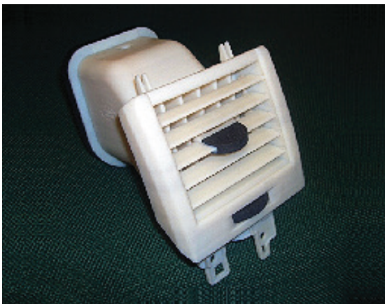
Jaguar Land Rover used The Objet500 Connex3D Printer to print a complete fascia air vent.

At Jaguar Land Rover, the Objet500 Connex 3D Printer was tasked with producing a complete fascia air vent assembly for a Range Rover Sport. It used rigid materials for the housing and air-deflection blades and rubber-like materials for the control knobs and air seal. In a single process, Jaguar Land Rover printed the complete fascia air vent as a working part. Once printed, the model was taken from the printer, cleaned and tested, proving that the hinges on the blades all worked, and the control knob had the right look and feel.