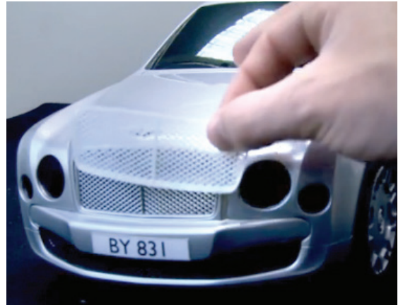
Bentley Motors designers print miniature scale models of vehicle interiors and exteriors.

PolyJet technology also allows companies to print translucent prototypes.