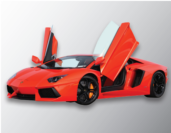
A carbon-fiber reinforced monocoque is key to the Lamborghini Aventador's light weight.

A prime example of shrinking the tooling process can be found in the 2011 Lamborghini Aventador, the sports car brand's flagship model. The $400,000 Aventador clocks in at 230 mph and owes many of its performance attributes to its carbon-fiber-reinforced composite monocoque, which makes up the core of the integrated body-chassis. It weighs 324.5 pounds, and the entire body and chassis weigh just 505 pounds.