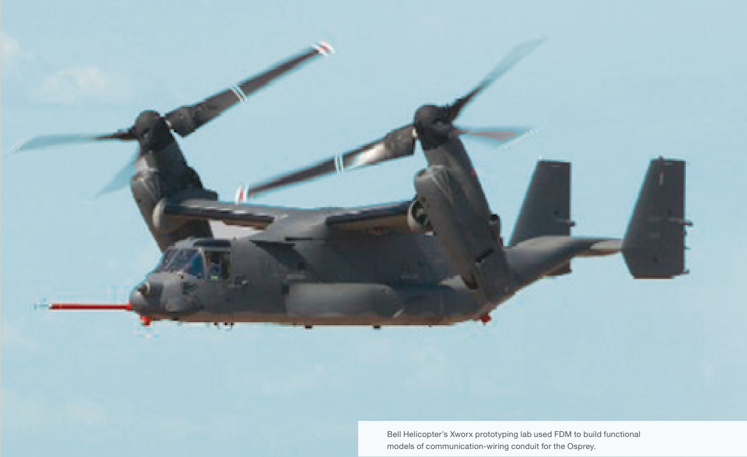
Bell Helicopter's Xworx prototyping lab used FDM to build functional models of communication-wiring conduit for the Osprey.