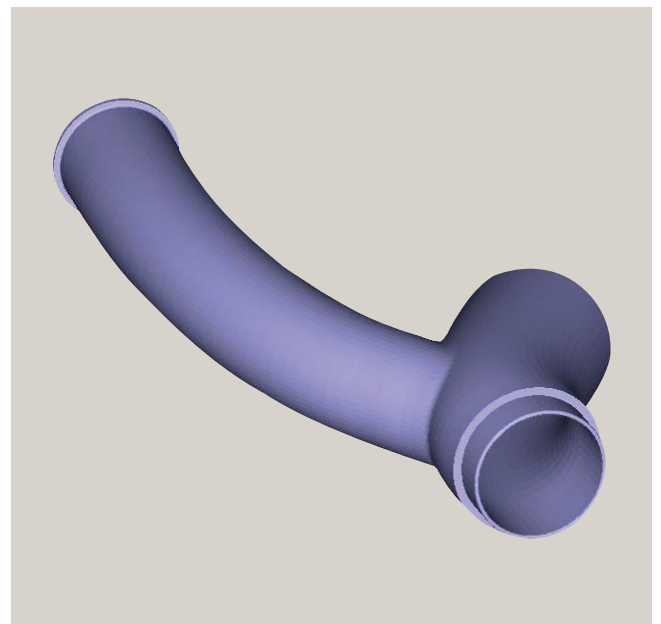
Two conduit sections installed for ground testing.